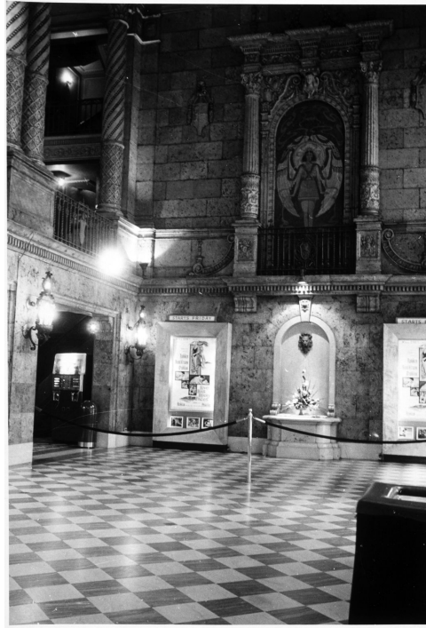
Paramount, St. Paul (c. 1965)

The Spanish Baroque Paramount on 7th Street was originally Finkelstein and Ruben’s Capitol Theater. It opened in 1920 with 3000 seats and was typical of the expansive, ornate movie houses purchased or built by Paramount and its predecessor, Publix, between 1927 and 1932.