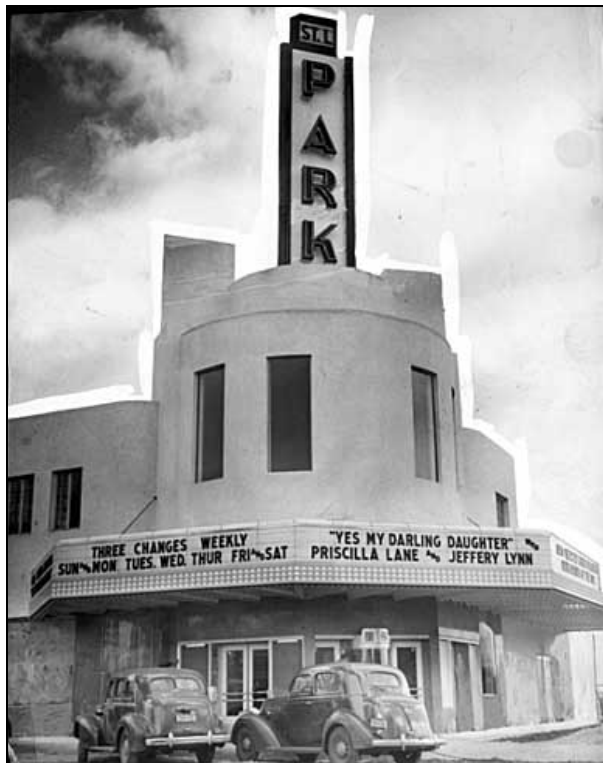
Park Theater, St. Louis Park (c. 1940)

chains was Finkelstein and Ruben, which owned as many as 140 Upper Midwest theaters in the 1920's, including the region's largest ever movie house, The Minnesota, a 4,000 seat Minneapolis behemoth. In the early sound era the Minnesota and other Finkelstein and Ruben theaters were purchased by Paramount's subsidiary, The Minnesota Amusement Company. By the late 1930's, of 450 movie theaters in the state, Minnesota Amusement owned 56 or 12%, including theaters in Rochester, Mankato, St. Cloud, Winona, Moorhead, Virginia, Hibbing, Austin, Fairmont, and St. Cloud. Those houses, however, accounted for 92% of the "first-run" theaters in Minneapolis, St. Paul, and Duluth and captured nearly 80% of the state's total film audience. 3