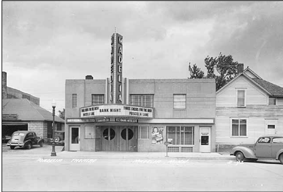
Madelia Theater (c. 1940)

films. Paramount's demand of two pictures at 50% of gross, four at 40%, two at 25%, and 50-100% increases on flat rate films, was typical. 44