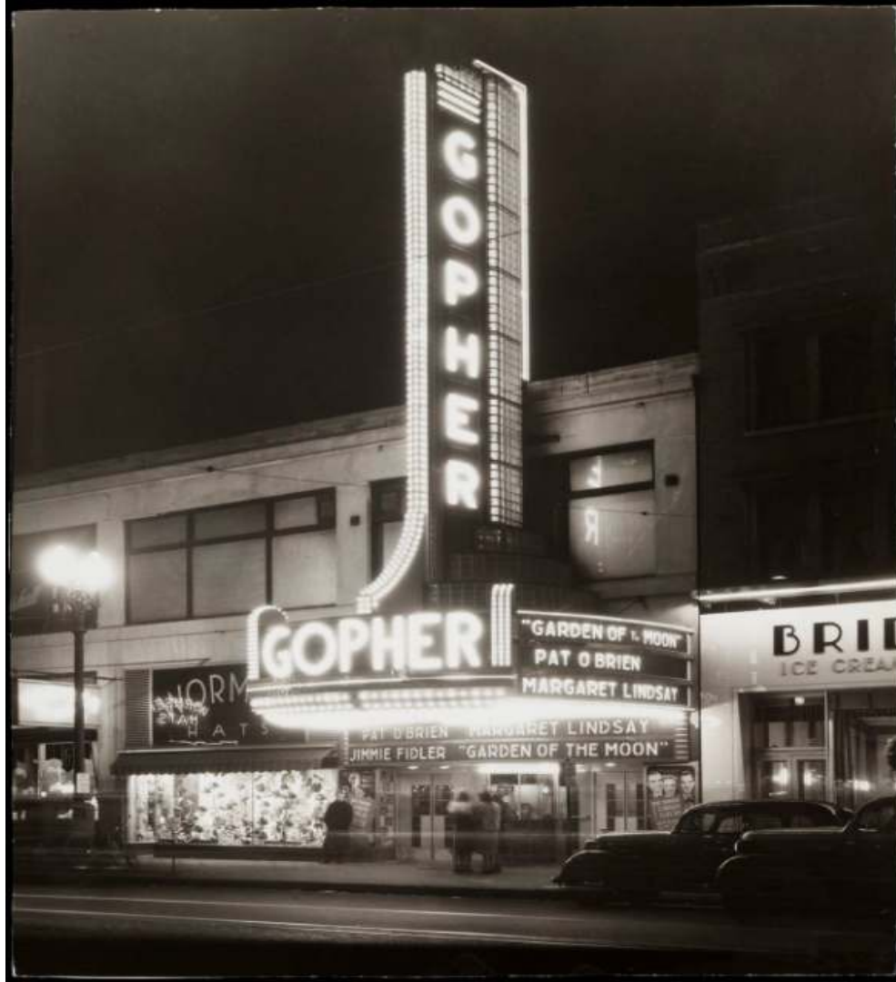
Gopher Theater, Minneapolis (c. 1938)