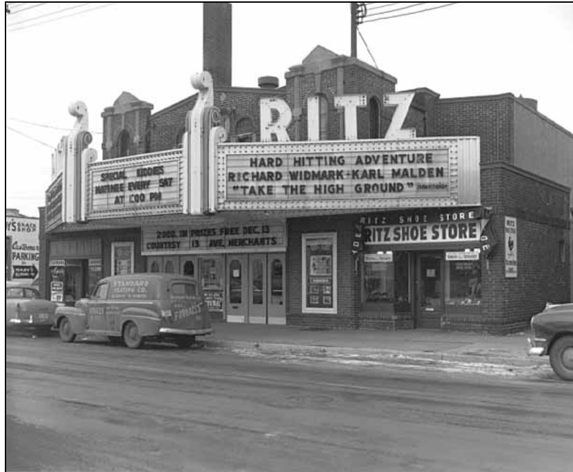
Ritz Theater, Minneapolis (c. 1953)